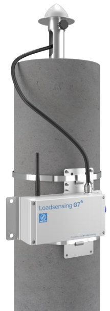
Fig. 3: Survey pole mount. Use the LS-ACC-BIG-HVP versatile mount plate to secure the device to a pole with metal clamps. Install the GNSS antenna on top of the pole using the LS-ACC-GNSS-RD 5/8-inch survey pole mount and the LS-ACC-GNSS-CL2 or LS-ACC-GNSS-CL3 cable extension. Suitable for base stations and rovers.