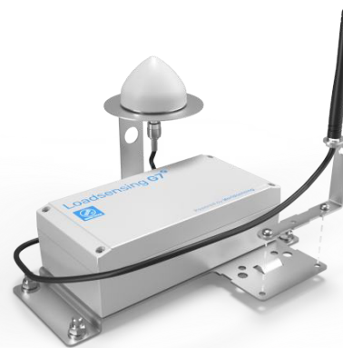
Fig. 4: Compact horizontal mount. Use the LS-ACC-BIG-HVP versatile mount plate to secure the device to a horizontal surface. Attach the LS-ACC-ANT-HVP versatile mount plate for the GNSS antenna to the node mount plate for a compact setup. Use the LS-ACC-ANT-LORA versatile LoRa mount plate and the LS-ACC-ANTS-G7 cable extension to position the LoRa antenna vertically.