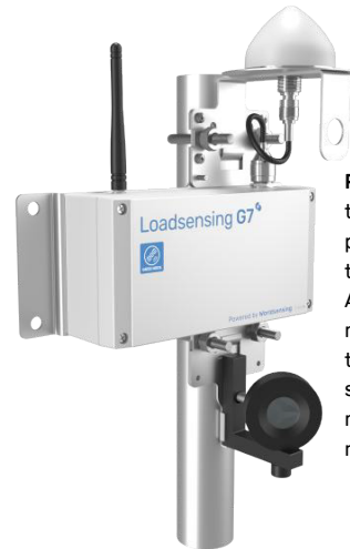
Fig. 2: Compact mount with u-bolts. Use the LS-ACC-BIG-HVP versatile mount plate and WS-ACC-U50 50 mm U-bolts to secure the device to a 50 mm pole. Attach the LS-ACC-ANT-HVP versatile mount plate for the GNSS antenna to the node mount plate for a compact setup. Add the LS-ACC-PRS VP prism mount plate for prism installation. Not recommended for base stations.